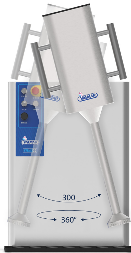
Horizontal and circular swing